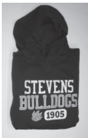
Bulldog "Pawprint" Hoodie (#9947) Screen-printed gray/white logo on Maroon or Navy sweatshirt S-2X: $24.00