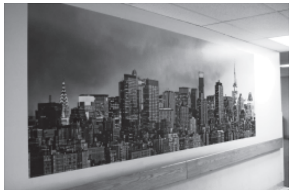
Cityscape mural at Branch Campus donated by Two Dudes Painting