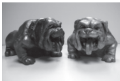
Resin bulldog in faux pewter or bronze finish. Size: 6"x4" - $30 plus tax