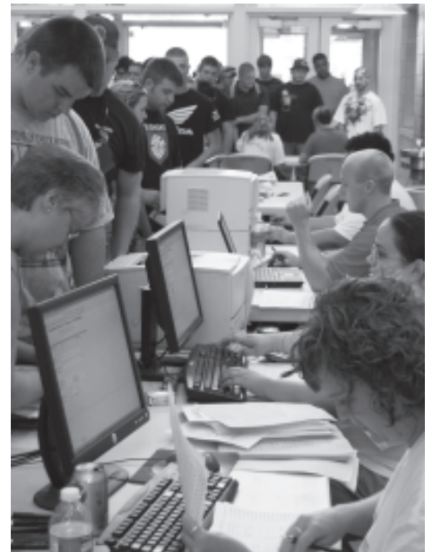
Speaking of new faces! There was a record number of freshmen coming to Stevens for Orientation on August 16th, which made for a very busy staff!