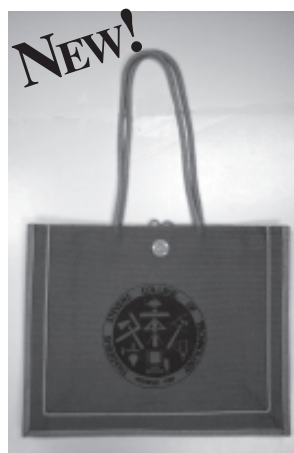
Eco-Friendly Tote Jute and natural vegetable fiber with cotton rope handles. Lime/Natural - $8.50 plus tax